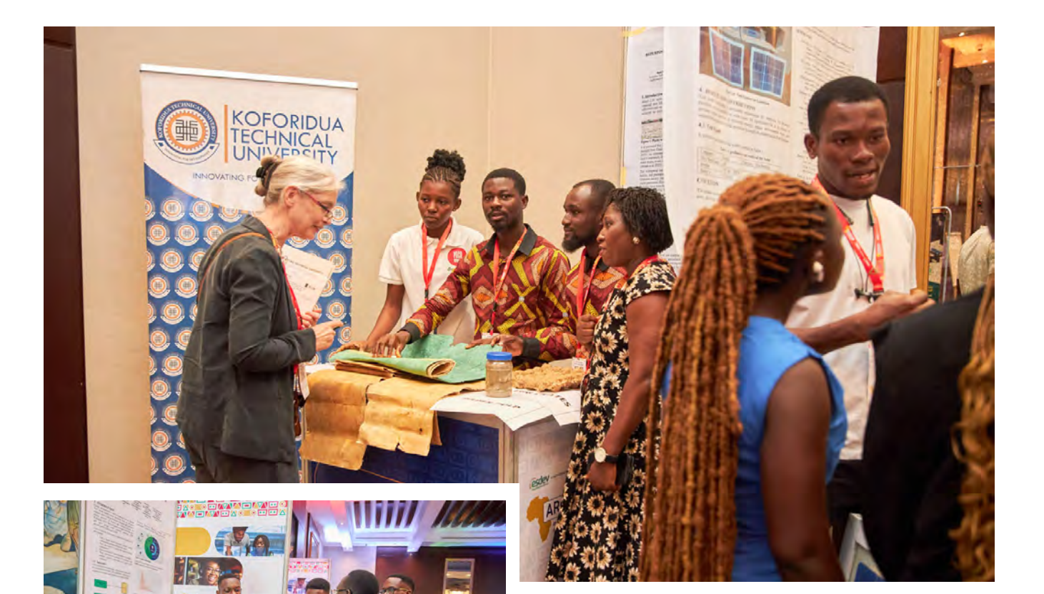
EXHIBIT SUBMISSION AND EVALUATION PROCESS